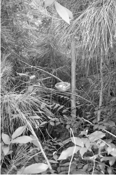
Figure 3. Nest placement in a tree