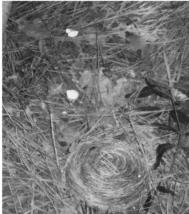
Figure 4. Predated nest.