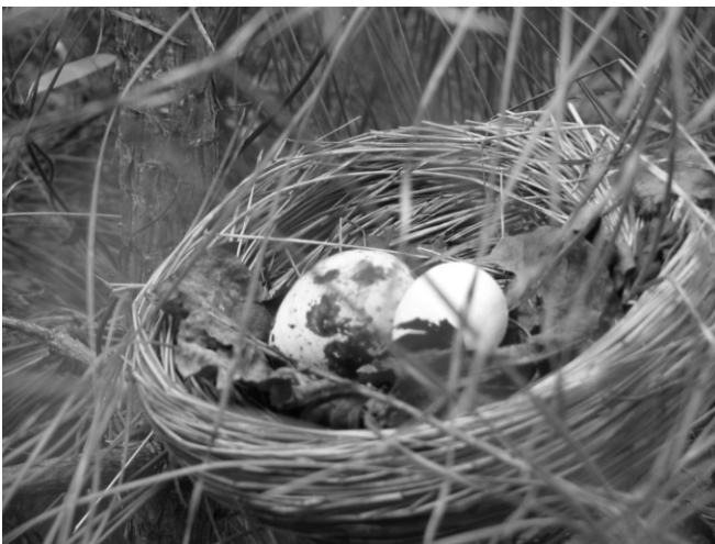
Figure 2. Artificial nest baited with one quail (l) and one clay egg (r).

Within each of the four primary habitat types ten locations were randomly chosen for nest placement. At each nest location two nests were placed; one at ground level and one on a tree branch, for a total of 80 nests used per season. Ground nests were placed next to a stump, fallen tree, or at the base of a tree. Arboreal nests were placed on a branch or in the fork of tree limbs 1 to 2 m above the ground (Fig. 3). Nests were placed a minimum of 50 m apart.