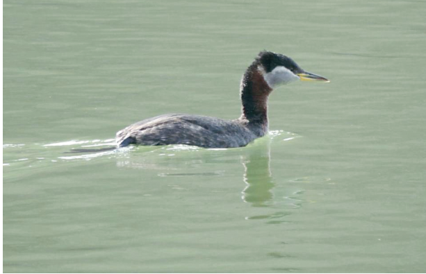
Figure 1. Red-necked Grebe, 4 March 2014, Steele Creek Park, Sullivan County, Tennessee.