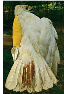
Figure 1. Leucistic Red-tailed Hawk found in Lawrence County, Tennessee.